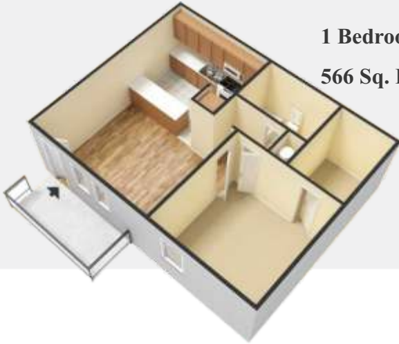
1 Bedroom / 1 Bath 566 Sq. Ft.*