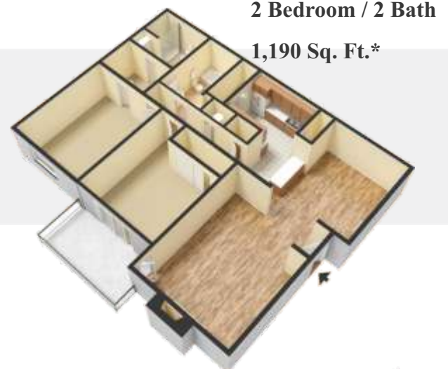
2 Bedroom / 2 Bath 1,190 Sq. Ft.*

*Square footage is approximate. Actual floor plans may vary.