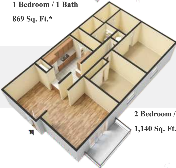
2 Bedroom / 2 Bath 1,140 Sq. Ft.*