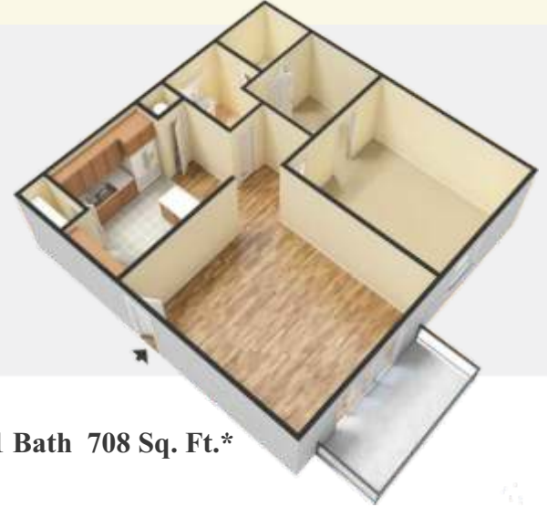
1 Bedroom / 1 Bath 708 Sq. Ft.*