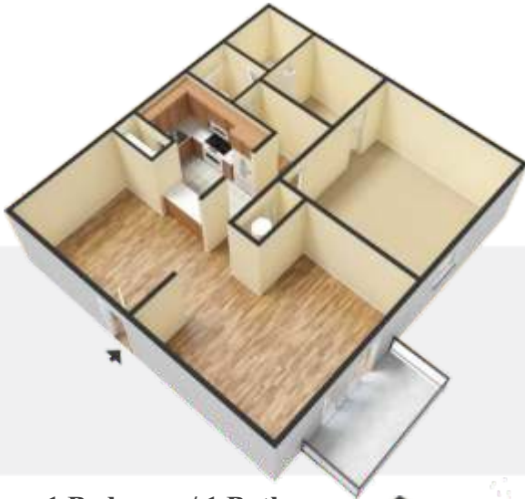
1 Bedroom / 1 Bath 869 Sq. Ft.*